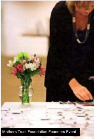
Mothers Trust Foundation Founders Event